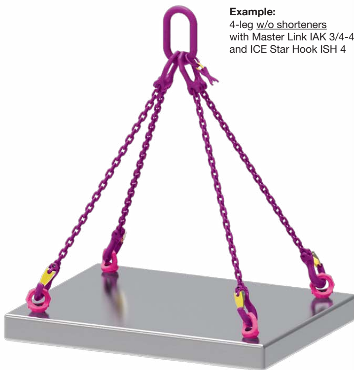
Example: 4-leg w/o shorteners with Master Link IAK 3/4-4 and ICE Star Hook ISH 4

The smallest Ø 4 mm round steel chain in grade 12 ICE