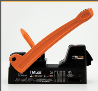
Lifting Magnet Type TML 250 Page 208

Depending on version these magnets can be used for a safe transport of flat material.