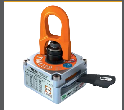
Lifting Magnet Type TML 100 Page 209