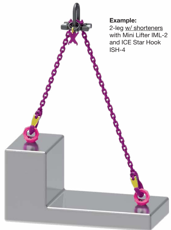
Example: 2-leg w/ shorteners with Mini Lifter IML-2 and ICE Star Hook ISH-4

The ideal assistant for small loads of up to 1.7 t, in incoming goods areas and for tool construction!