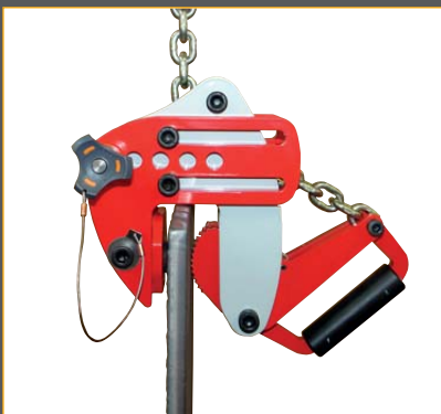
Automatic Safety Lifting Clamp Type CGSMVZ, adjustable Page 194

Carl Stahl offers a comprehensive range of high-quality lifting clamps in this three operating modes: Micro form closure, force closure and form closure.