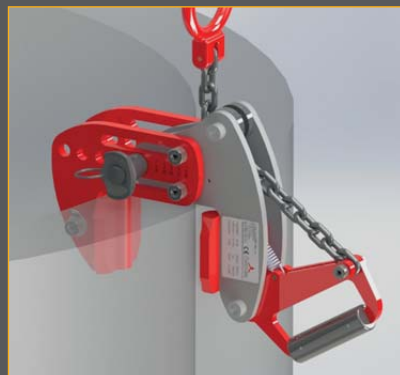
Automatic Safety Lifting Clamp Type CGSMVR, adjustable Page 195