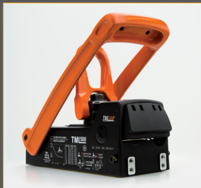
Lifting Magnet Type TML 500 Page 208