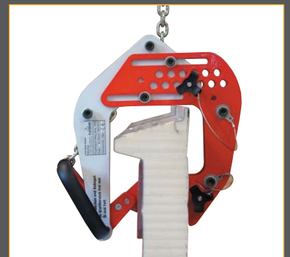
Safety Lifting Clamp for sandwich panels Type CGSMVS Page 199