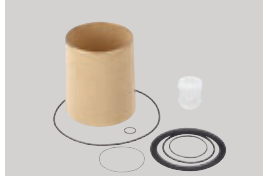
Service kit, automatic drain