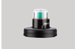
Service life indicator (pneumatic)