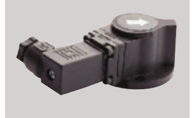
Service life indicator (electrical)