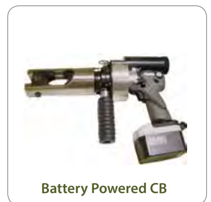
Battery Powered CB