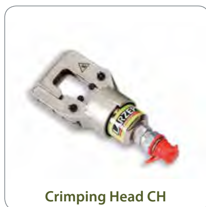
Crimping Head CH