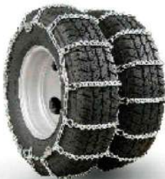
Available in dual