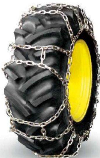
Square Link Duo