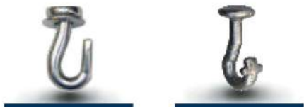
Special order available with swivel & 5858SP hook shown here

We manufacture and assemble chains for any application with trusted traction for snow removal and agriculture machinery. All made from pewag nickel manganese alloy square link; guaranteed to last longer and outperform conventional twist link. Also, can be reversed for extended life of your chain. • Always pre-fit chains before use