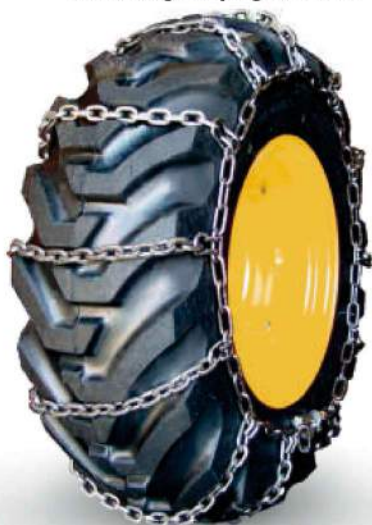
Square link single-spaced