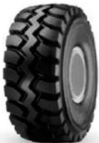
Goodyear 20.5R25 GP-2B G3

Dia: 58.1" = Cir: 182.53" x Width: 20.9" = 3815 sq in.