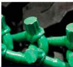
NEW starstud Design