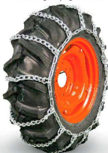
Twist link single-spaced