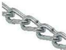
Close-up of link