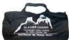
Nylon carry bag