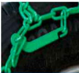
(8250-N) 8mm Lever