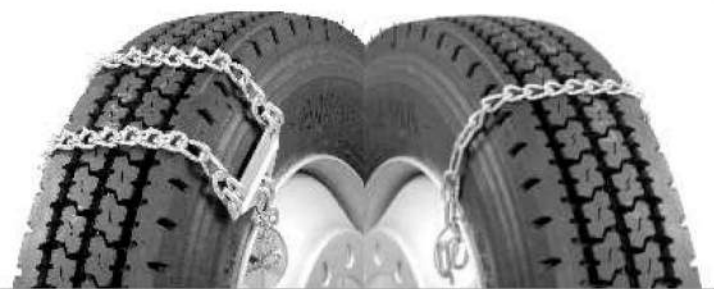
6085V / 6088V