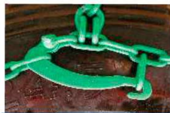
(8250-KST) 7mm Lever