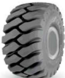
Goodyear 20.5R25 RT-5C L5

Dia: 58.1" = Cir: 182.53" x Width: 20.9" = 3815 sq in.