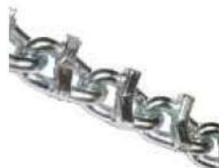
Close-up of V-Bar