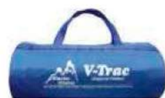
Nylon carry bag