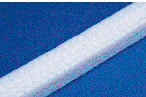
ML 2236 FDA

Limitations: Shaft speeds to 1200 FPM; temperatures to 500°F/260°C; pH range 0-14.