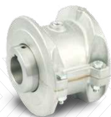
T10 Close-Coupled (Horizontally Split Cover)