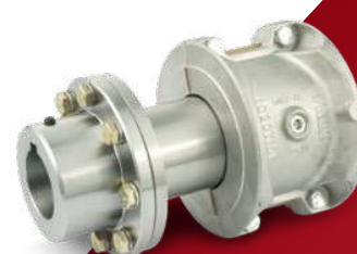
T35 Half Spacer (Horizontally Split Cover)