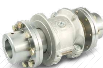
T31 Full Spacer (Horizontally Split Cover)