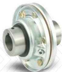
T20 Close-Coupled (Vertically Split Cover)